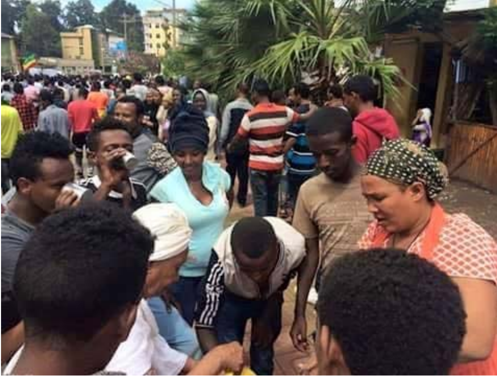
#AmharaProtests in Gonder Solidarity with #OromoProtests