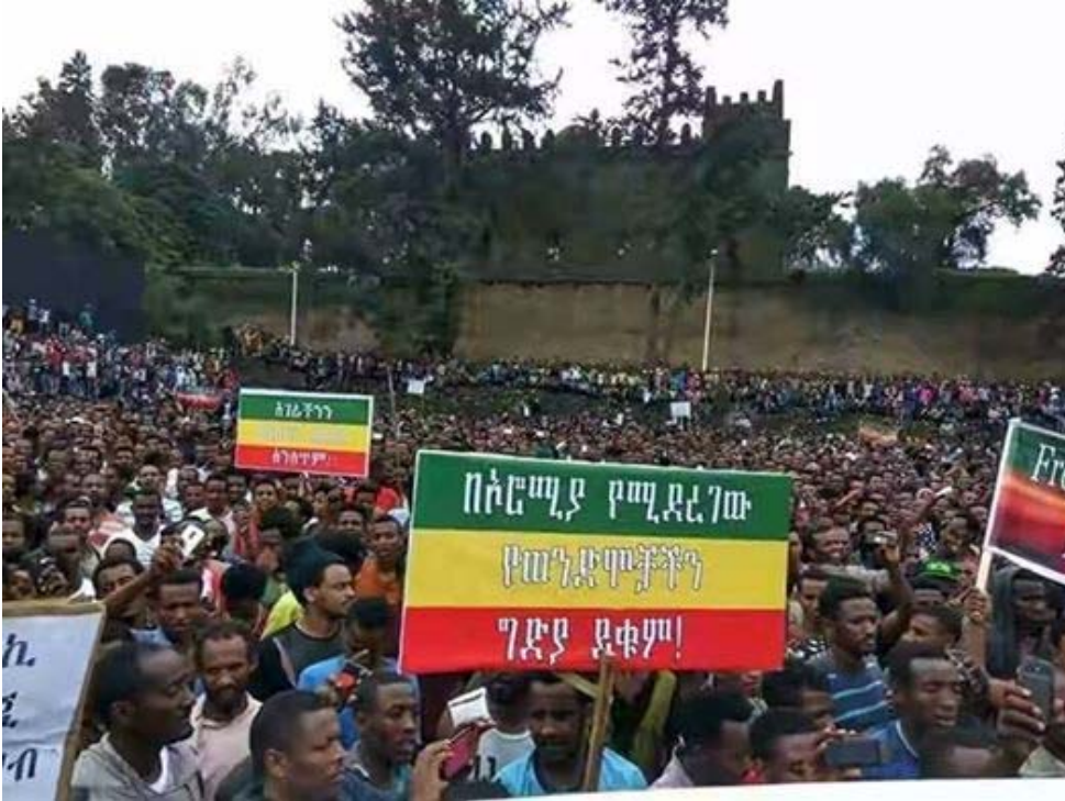
#AmharaProtests Beautiful and Powerful sight as leaders of various religious groups address the protesters in Gonder.