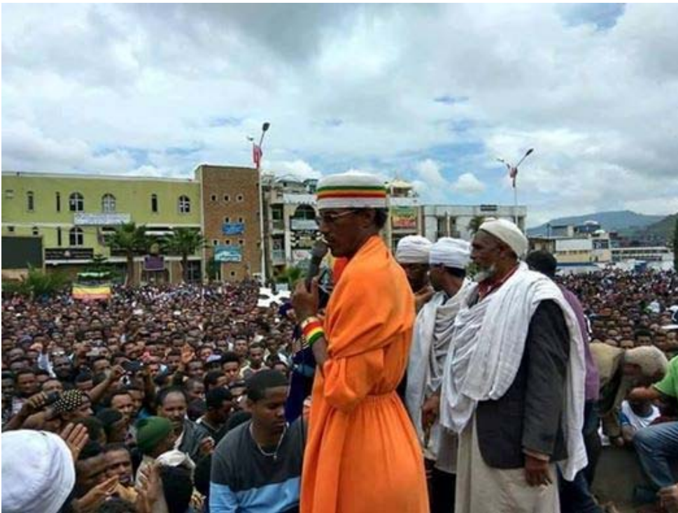
#AmharaProtests የህወሀት የበልይነት ደቁም!! ( General Tsadkan, are you reading this? This is the core of whats fueling the mass uprising in